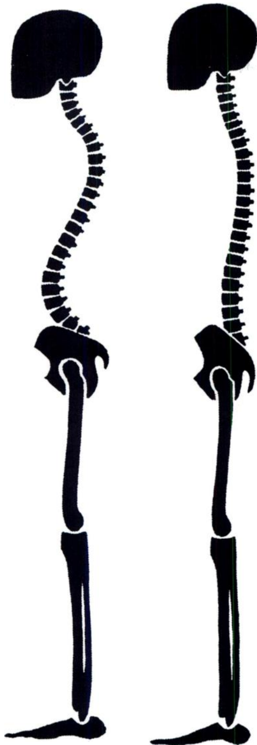
FIGURE 1. Habitual patterns of lordotic ("slumped") posture are common ( left ). 14 Proprioceptive musculoskeletal education, as described by Alexander 3 and others 3,4 teaches voluntary elongated posture ( right ).

164.0 ± 6.0 cm. Mean height of the ten subjects was 169.5 ± 8.9 cm. Each subject completed a course of at least 20 private lessons in the AT and returned for follow-up testing (mean interval 6.8 ± 4.6, range 2.7-18.4 months). Eight of the ten subjects in group 1 received lessons at approximately weekly intervals; two received lessons two or three times weekly. Two of the courses of lessons contained